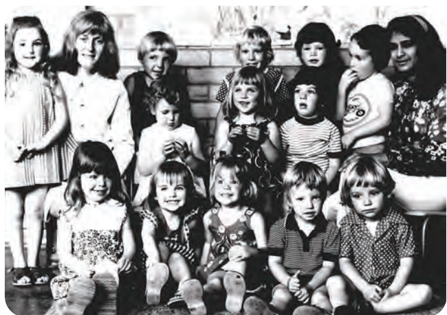
Our first Montessori Classroom was established in 1974.

In late 2013, MMS purchased the Brighton campus and surrounding grounds, supporting the expansion of the Junior School and allowing the establishment of the Senior School. The Senior School delivers the Montessori Adolescent Program, Montessori Careers Program (MCP) and the International Baccalaureate (IB) Diploma Programme. It continues to grow, year by year with the first Year 12 cohort graduating at the end of 2020.